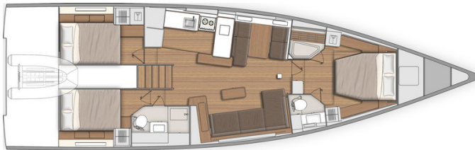
3 cabins 3 heads - Skipper's cabin version: