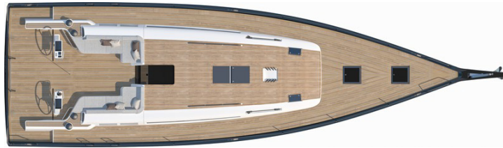
3 cabins 2 heads version: